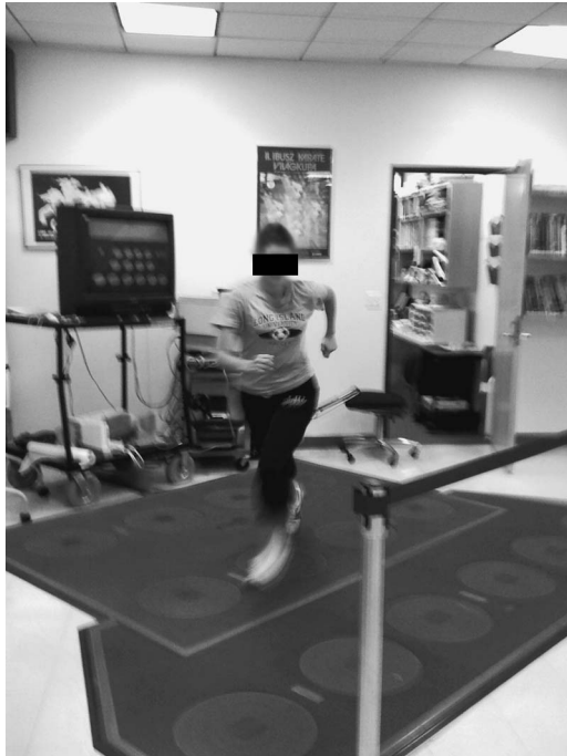
Figure 1. An athlete responding to a sensory stimulus (monitor pictured in the background), running toward the end sensor (pictured in the foreground).